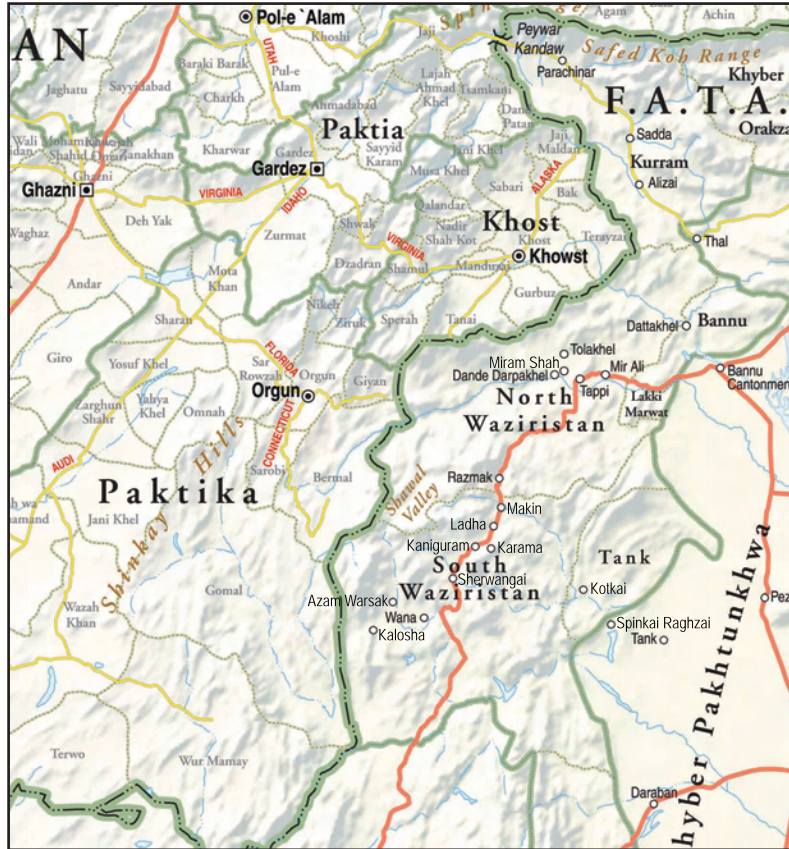
MAP 11 | AFGHANISTAN-PAKISTAN BORDER REGION