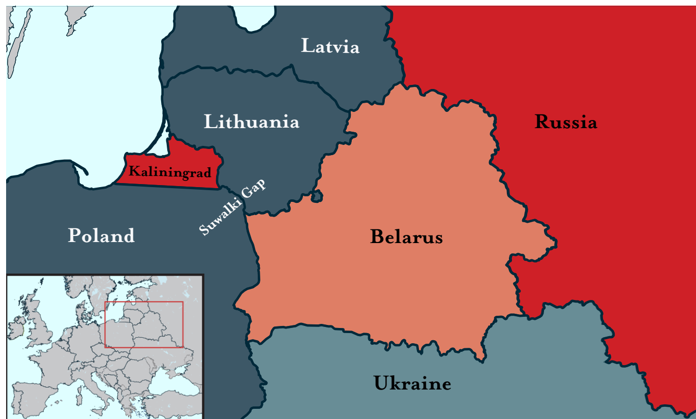
Figure 1. The Suwalki Gap along the Poland-Lithuania border.

Should Moscow acquire the ability to deploy its own ground forces in northwestern Belarus—around Grodno, say—it would be able to threaten the Suwalki GLOC credibly without putting Kaliningrad at risk. Such a deployment would be likely to increase substantially the risk to NATO's ability to keep significant forces in the Baltic states