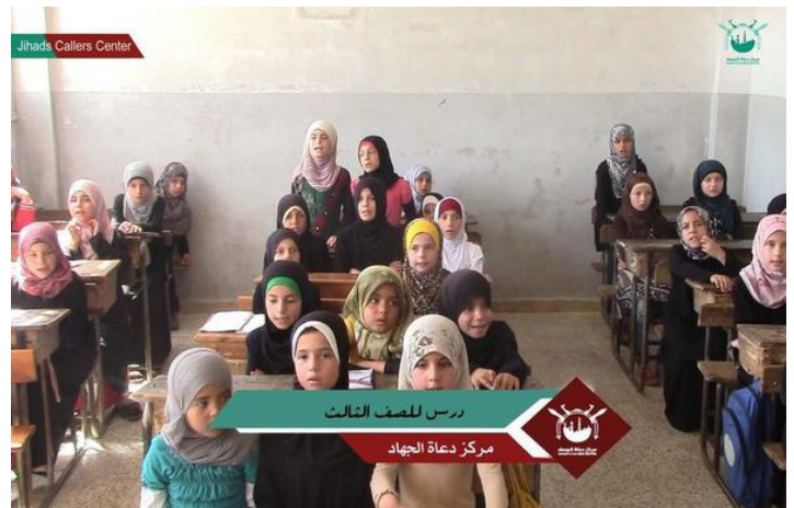
(Left) The photo shows a Shari'a class for women held by the Aisha Mother of Believers Institute, operated by Jabhat al Nusra's Jihad Callers Center in northwestern Syria. (Right) The photo shows Shari'a classes for young girls held by Jabhat al Nusra's Jihad Callers Center in northwestern Syria. Photos from social media available from author upon request.