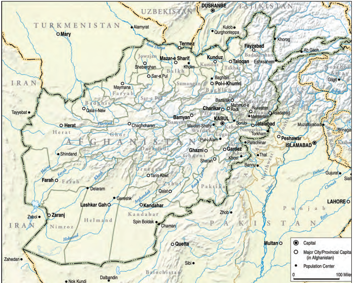
MAP 1 | AFGHANISTAN