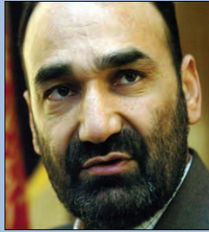
ATTA MOHAMMAD NOOR

CURRENT POST: Governor of Balkh Province (2004-present) RELEVANT POSTS: Governor of Balkh Province Supporter of Abdullah Abdullah in 2009 ETHNICITY: Tajik, b. Balkh Province ACTIVITIES DURING THE TALIBAN ERA: Commander of 7th Corps, Northern Alliance who, along with Abdul Rashid Dostum, drove the Taliban out of Mazar-i Sharif