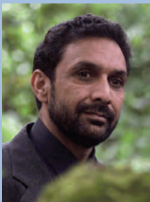
AHMAD ZIA MASSOUD

ACTIVITIES DURING THE TALIBAN ERA: Member, Northern Alliance