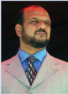
MARSHAL QASIM FAHIM

ACTIVITIES DURING THE TALIBAN ERA: Advisor and physician to Ahmad Shah Massoud