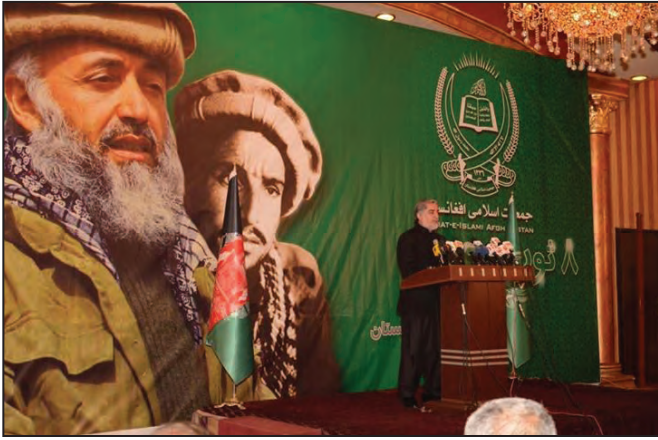
PHOTO 1 | ABDULLAH ABDULLAH SPEAKS AT A JAMIAT CONFERENCE.

registration deadline before making his preferences for the 2014 election publicly known.