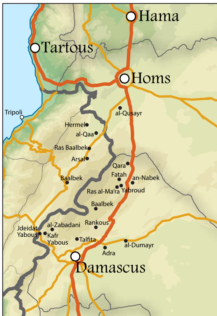
Figure 1 Lebanese and Syria border region

This spring Hezbollah offensive firmly consolidated regime control from Damascus to Homs along the M5 highway. It also forced surrender of besieged rebels inside of Homs city by May 2014. 3 However, pro-regime forces were unsuccessful in fully neutralizing the cross-border smuggling networks supporting rebels in Qalamoun. These networks continue to make the Qalamoun region valuable terrain for both rebel and jihadist groups as of March 2015. The Qalamoun region facilitates rebel operations on other battlefronts in Syria, 4 to include Eastern Ghouta in Damascus additionally. 5