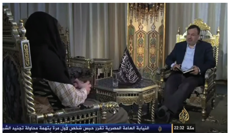
Al-Jazeera interview with JN Leader al-Joulani (May 27, 2015)

nonetheless provide Zawahiri with new options to replace Wahayshi or otherwise absorb his death if Zawahiri is willing to depart from past traditions. Even though these commanders do not have the same set of credentials as typical al-Qaeda leaders, many of them fought U.S. forces during the 2003-2008 Iraq War or in Afghanistan after bin Laden's initial resistance in Tora Bora. These individuals offer Zawahiri a promising source of future leadership within al-Qaeda because of their battlefield experience and, in many cases, their demonstrated commitment to fighting the U.S. Because some of these commanders have extensive regional networks, they