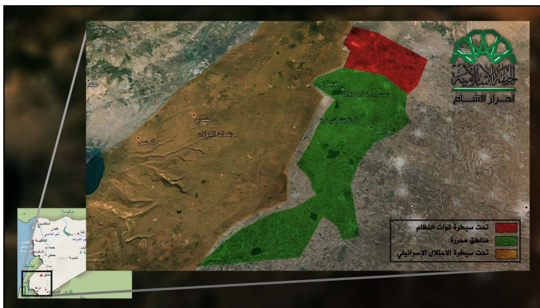
A map distributed on September 16, 2014 by Ahrar al-Sham (HASI). The green area shows alleged rebel gains in Quneitra province.

clashed with ISIS, raided ISIS sites, and expelled the group's members from Eastern Ghouta to the southern Damascus neighborhood of al-Hajar al-Aswad. 28 While overt ISIS operational capabilities were degraded in Eastern Ghouta, fears and reports of ISIS sleeper cells in the suburb remain. 29