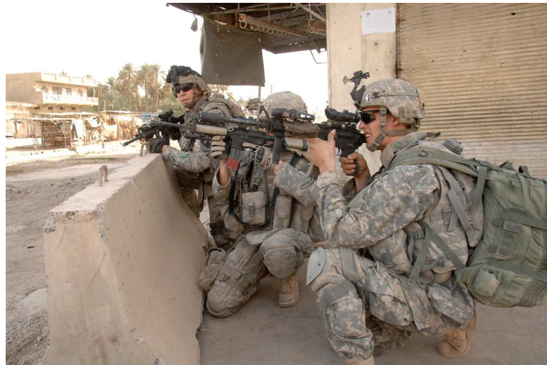
Soldiers from Alpha Company, 2-23 Infantry Regiment, 4th Brigade Combat Team, 2nd Infantry Division take cover behind a barrier while looking for the direction of fire they received, in West Muqdadiyah, Iraq.

During these four days of operations Coalition forces also discovered nine weapons caches containing “anti-aircraft weapons, sniper rifles, more than 65 machine guns and pistols, 50 grenades, a surface-to-air missile launcher and platform, 98 personnel mines, 170 pipe bombs, 130 pounds of homemade explosives, 21 rocket propelled grenades, numerous mortar tubes and rounds.” 10 These weapons were destroyed to prevent their future use by enemy forces.