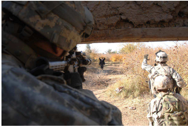
A U.S. Army Soldier from Alpha Company, 2-23rd Infantry Regiment, 4th Brigade Combat Team, 2nd Infantry Division, keeps his weapon aimed while his partner confronts a local man with a weapon approaching them from the vine groves in west Muqdadiyah, Iraq, Dec. 12, 2007.

Coalition forces continued operations against AQI north of Muqdadiyah in the new year. On January 2 nd Coalition forces detained four individuals associated with the network north of Muqdadiyah. 20 On January 3 rd an AQI safe house in Muqdadiyah was targeted in the morning and then another terrorist group operating in the region was engaged in the afternoon. In these two operations 7 terrorists were killed. 21 The next day, on January 4 th , Coalition forces conducted two coordinated operations north of Muqdadiyah targeting individuals associated with “the leader allegedly responsible for directing a large terrorist group that conducts executions in the region.” 22 Intelligence reports indicated that this group had executed two individuals in the previous few days and was the same group involved in firefights with Coalition forces in the preceding weeks. In the two separate operations Coalition forces killed 2 terrorists, detained 2 others and destroyed an AQI safe house. 23