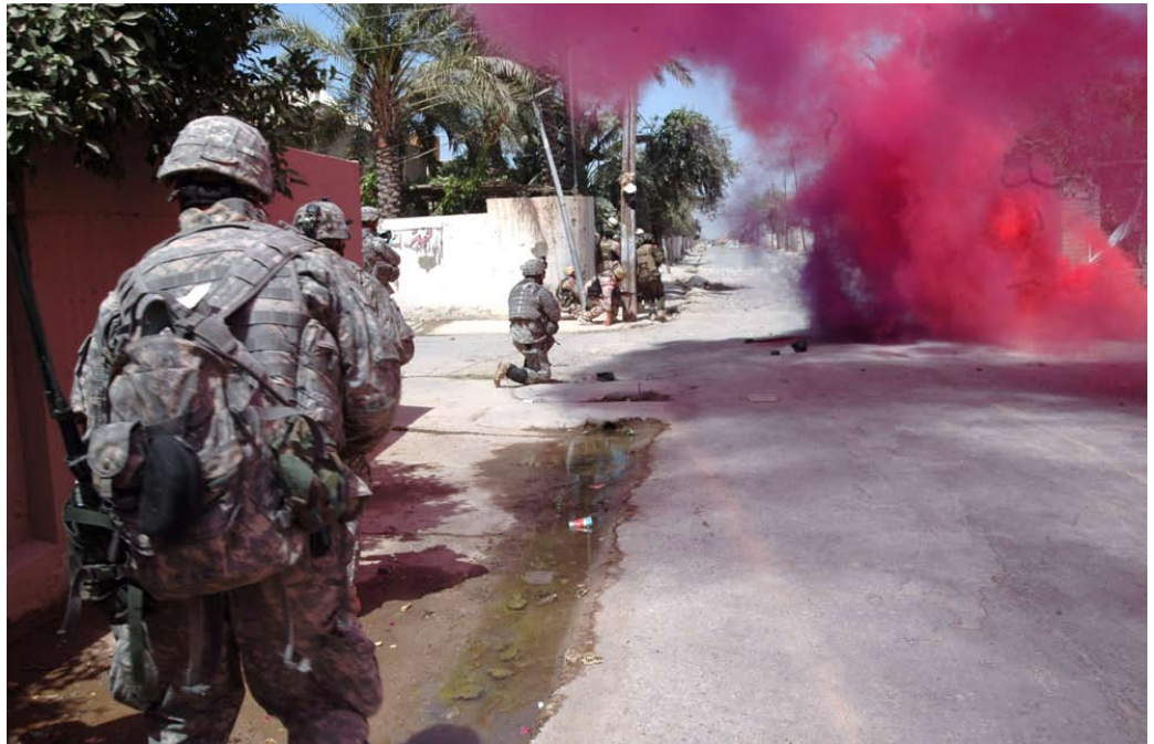
Soldiers from the 5th Iraqi Army Division, run through a smoke screen in Baqubah, Iraq, June 22, as Soldiers from the 3rd Stryker Brigade Combat Team, 2nd Infantry Division, from Fort Lewis, Wash., follow. The action was part of Operation Arrowhead Ripper, a joint effort between U.S. and Iraqi security forces to defeat al-Qaida terrorists and secure the city.

The Corps concentrated nearly 10,000 U.S. and Iraqi troops in Diyala to liberate the city and interdict any insurgents who tried to escape. Accordingly, the plan involved cutting the major lines of communication out of the city. Arrowhead Ripper began on June 19, 2007. “In the first hours of the American military assault, after midnight early Monday, helicopters flew two teams of American troops and a platoon of Iraqi scouts so they could block the southern escape routes from the city. Stryker armored vehicles moved along the western outskirts of Baqubah and then down a main north-south route that cuts through the center of the city. By the time dawn broke on Tuesday, the insurgent sanctuary in western Baqubah had been cordoned off. Then, the American forces established footholds on the periphery of the section and slowly pressed in.” 24 Rather than projecting force from established positions in eastern Baqubah and Buhriz, U.S. forces attempted to surprise the enemy by