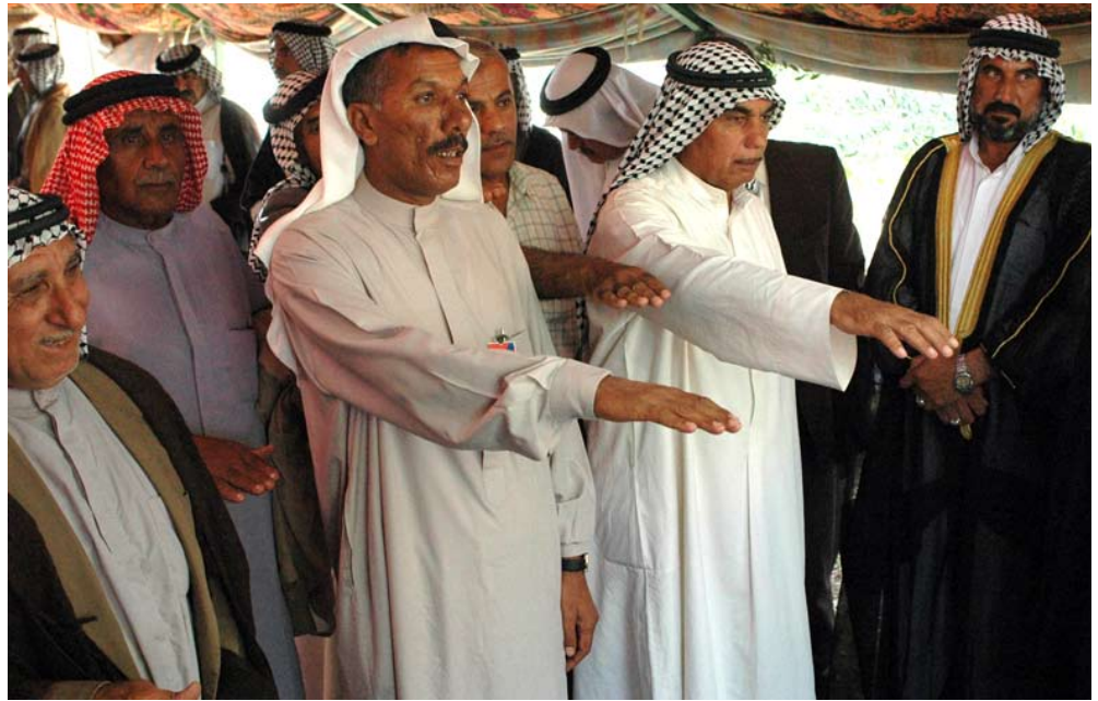
Tribal leaders from the northern Diyala River Valley swear on a reconciliation agreement following a meeting at Forward Operating Base Fallock, an Iraqi Army base, Oct. 8. Approximately 70 leaders from Muqadadiya and the surrounding areas gathered to discuss uniting in the fight against terrorism and the way ahead.