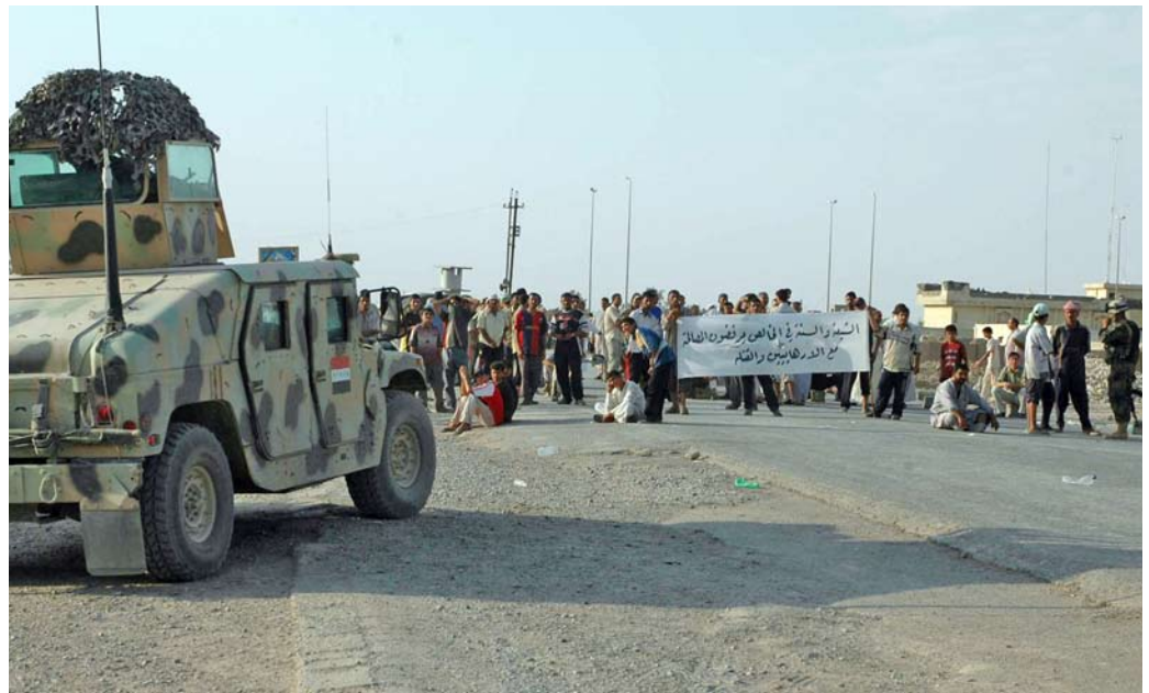
A group of protesters conducting a peaceful demonstration in Khalis, Iraq, block a main supply route into the city, Aug. 21. The demonstration began after several mortar attacks from an unknown enemy, causing more than 500 concerned citizens to protest until they received security and services from the security officials and the local and central governments.

Militia violence increased the number of retaliatory attacks by al Qaeda, including kidnappings, mortar attacks, and the bombing of a significant bridge connecting Khalis and its villages to Baqubah (aimed evidently at cutting extremists’ movements). 102 Gunmen, whose affiliation is not specified, also increased attacks and established unauthorized checkpoints along the Khalis-Hebheb-Baghdad road. 103 Local government and