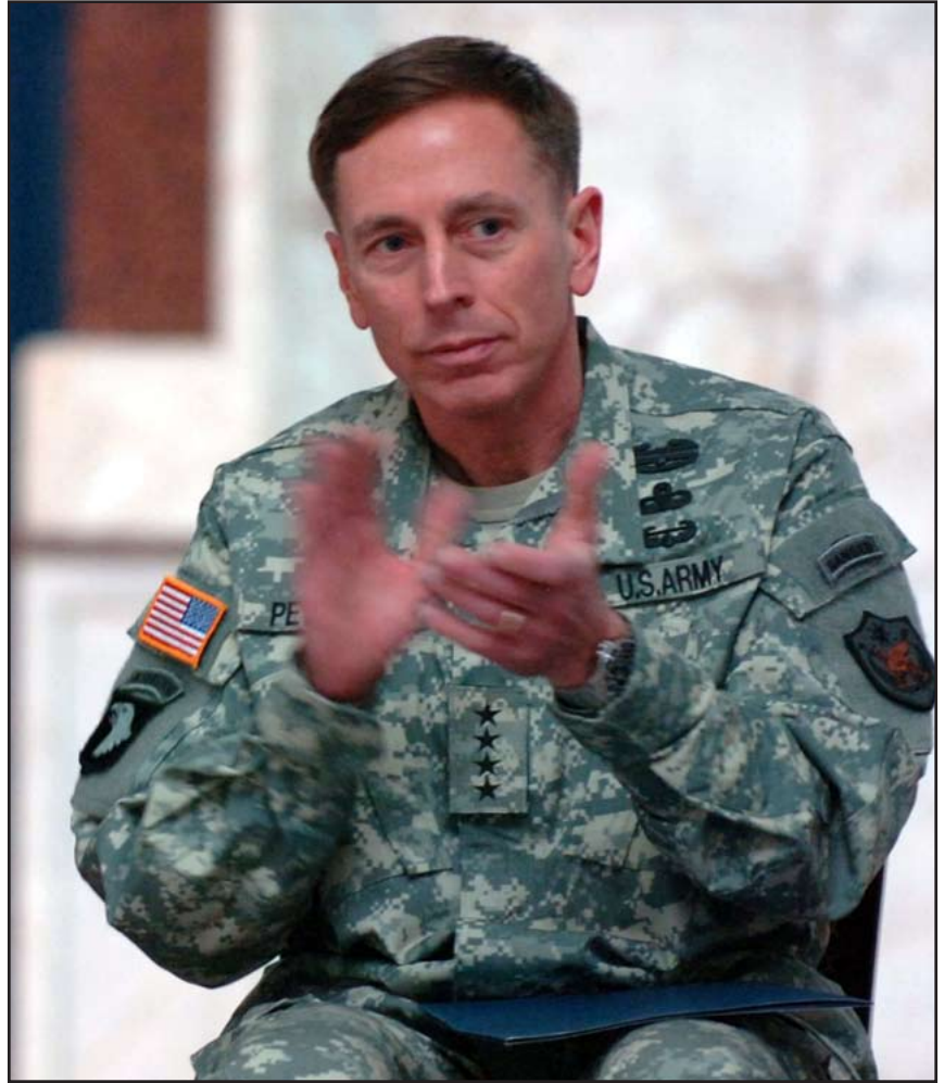
Army Gen. David H. Petraeus claps during the Multi-National Force - Iraq change of command ceremony on February 10, 2007. During the ceremony, Army Gen. George W. Casey, Jr. relinquished command to Petraeus.

Although President Bush authorized a troop increase of five Army BCTs plus smaller units of Marines, only one, the 2nd BCT of the 82nd Airborne Division, arrived in Baghdad before Operation Enforcing the Law began. Its deployment added between 2,700 and 3,000 troops to Baghdad, which, along with the Iraqi Army and police