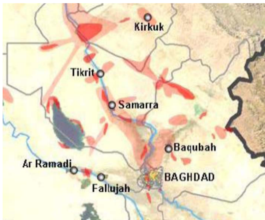
Map of al-Qaeda in Iraq’s Capabilities as of March 2008

Multi-National Division – Center’s operations in the Baghdad Belts show the effects of American counter-insurgency strategy when combined with sufficient force density. In a span less than a year, both MND-C and Multi-National Force – Iraq were able to make decisive gains against al-Qaeda in Iraq. Indeed, the group has been all but eliminated from MND-C’s area of operations. This has no doubt contributed to the increased security seen in Baghdad.